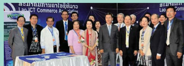
LICA Booth at Lao ICT Expo 2018.

There were a total of 27 delegates from more than 7 countries such as Bhutan, Japan, Malaysia, Myanmar, Sri Lanka, Thailand and Taiwan in this trade visit.